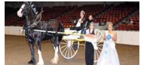
Champion Cart Mare, Hickory Hill Eleanor