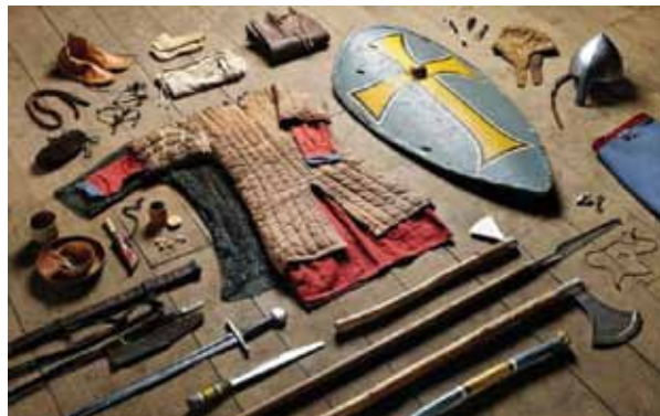
Huscarl gear - Battle of Hastings 1066.

they were Percherons. These were the horses talked about in English history. Many of the old castles, whose ruins remain today, were originally built by William I, and were used as fortresses to control those areas. Many of those sites today are only piles of rubble, but others were remodeled over the years by ruling landlords, and have become historical sites, as with Rockingham Castle, the present site of the Shire Horse Society office. These remodeled castles and the surrounding areas were almost like mini countries, and it is from these holdings and others that we hear stories about the knights.