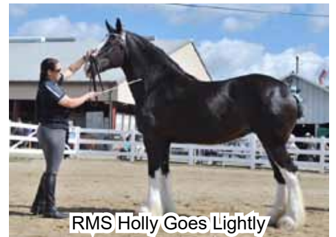
RMS Holly Goes Lightly