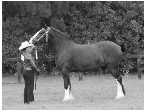
Right Picture: Nanette Osterhoudt and her mare Axeholme Elusive at a local open show in WI